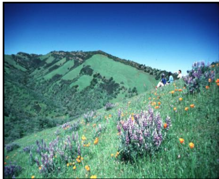
Figure 2 Mosaic treatments in chaparral

thinning regimes work to emulate the structural composition created by wildfire. Although thinning will not achieve the same ecological results as a natural fire, the openings and patches of vegetation that are created can increase the potential for a variety of habitat types. Mosaic thinning takes into consideration the site-specific conditions of the plant community type in order to choose the best prescription for a given area and to make allowances for a variety of ecological concerns that may arise during treatments where on-site direct adaptive management 49 will need to be practiced. For example, in certain portions of a treatment area, thicker vegetation and tree cover may be left to provide thermal cover 50 for deer and other wild-